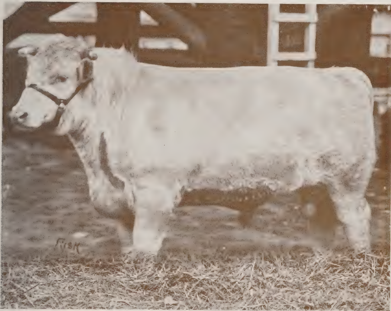
Supreme Magnet by Village Supreme. Junior Champion bull at the 1922 Sni-A-Bar Show. Recently sold to head the herd at Merryvale Farms, Martin City, Mo.